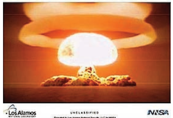
Central Mission of Los Alamos National Laboratory

May 2008: NNSA releases its final Site-Wide Environmental Impact Statement (SWEIS) for Continued Operations at LANL, in order to implement the proposed expanded production level of 50-80 pits per year. Regarding both the Complex Transformation PEIS and the LANL SWEIS, Nuclear Watch and others argued that a decision to expand pit production should await the outcome of the Obama Administration's high-level Nuclear Posture Review. NNSA eventually agreed.