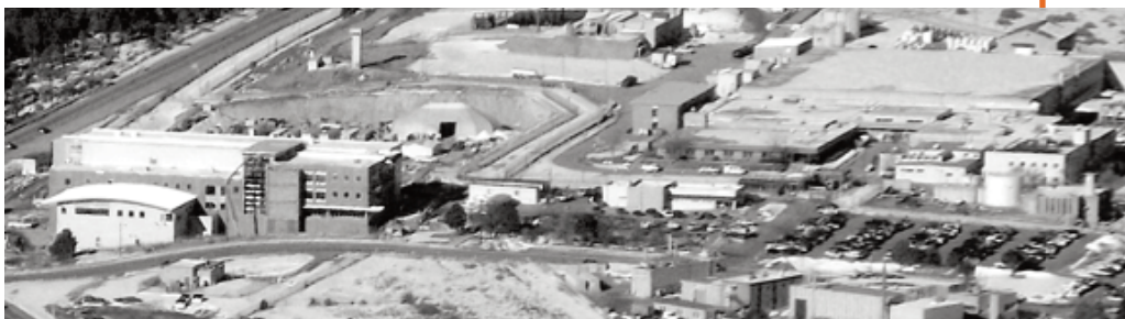
LANL's existing plutonium pit production facility on right, the newly built CMRR Rad Lab on left, with premature excavation for unbuilt Nuclear Facility behind it.

Amazingly, the new CMRR supplemental environmental impact statement explicitly stated that, despite a $6 billion price tag, the Nuclear Facility would create no new permanent jobs; it would merely relocate existing Lab jobs. Nuclear Watch heavily publicizes that admission to counter the "jobs, jobs, jobs" argument, a hot issue at that moment given the ongoing New Mexico Senate race.