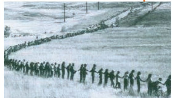
Rocky Flats nuclear weapons facility, 1983. People circle the facility in protest.

June 6, 1989: A dramatic FBI raid investigating environmental crimes abruptly ends plutonium pit production at Rocky Flats. A federal judge seals the subsequent grand jury report (still sealed to this day), and the U.S. District Attorney quashes criminal indictments against the Rockwell Corporation (Rocky Flats' manager) and responsible Department of Energy officials.