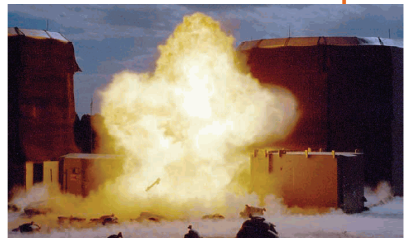
Open air explosive test at DARHT

3) Stop construction while completing a DARHT EIS. DOE readily agreed to the first two demands, but refused to halt construction, absurdly arguing that continuing construction would not bias the agency toward operating the facility. DOE lost in court, and a federal judge enjoined DARHT construction while the EIS was being completed.