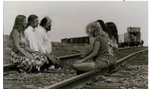
Allen Ginsberg, Peter Orlovsky and fellow meditators block the supply rail for Rocky Flats nuclear weapons production facility, June 1978.

April 28, 1979: An estimated 15,000 citizens protested nuclear weapons production at the gates of Rocky Flats, with numerous speakers including poet Allen Ginsberg and musicians Jackson Browne and Bonnie Raitt. The next day 286 protesters, including Daniel Ellsberg (leaker of the Pentagon Papers), were arrested for civil disobedience.