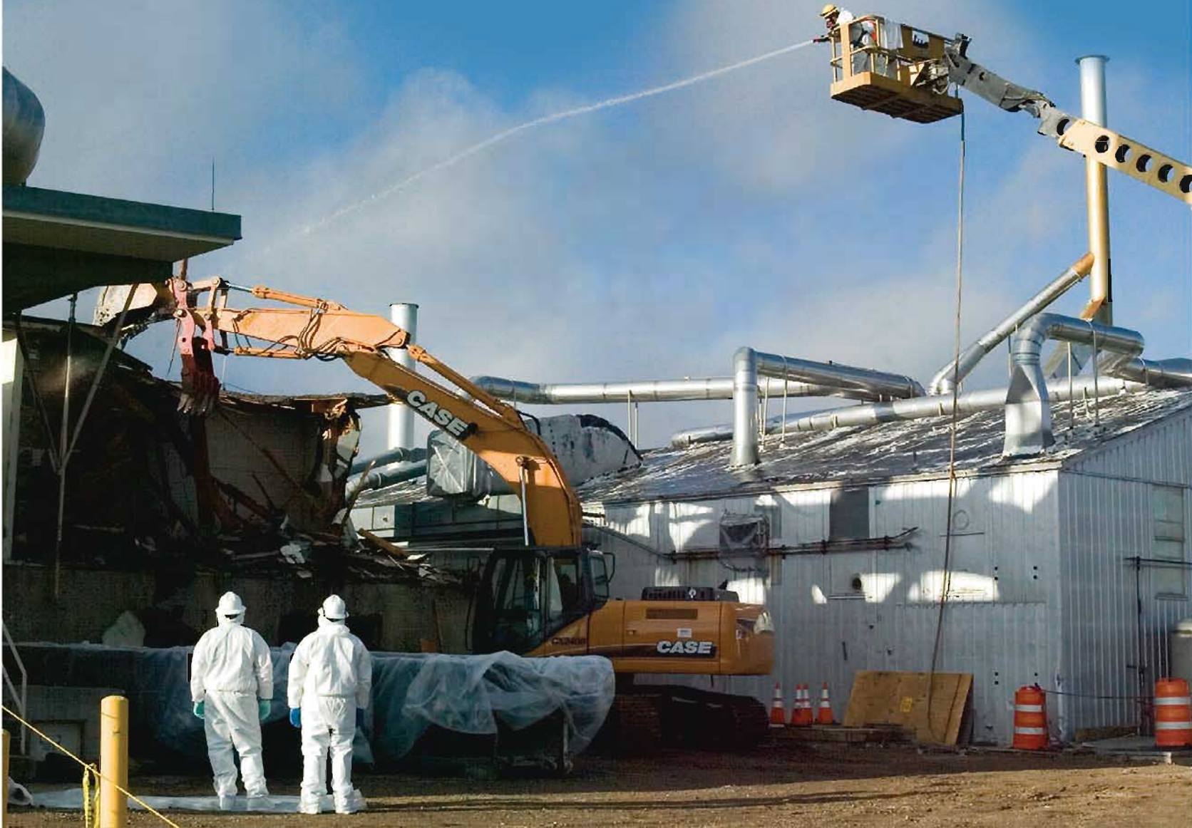
TA-21 Demolition, 2010