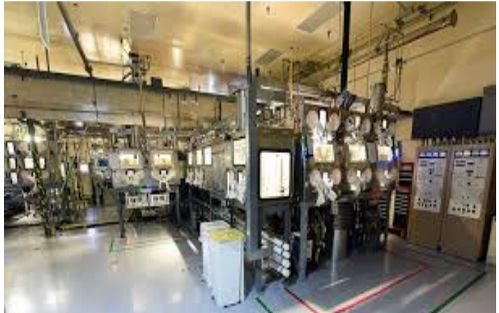
The plutonium facility at LANL.

• Further, in 2014 a radioactive waste barrel improperly prepared by LANL ruptured at the Waste Isolation Pilot Plant (WIPP) in southern New Mexico, contaminating 21 workers and shutting down the only repository for plutonium wastes from pit production for almost three years. Waste disposal at WIPP remains seriously constrained, even as there are increasing demands on its capacity from all across the country. It's not clear where all future radioactive wastes from expanded pit production will be disposed.