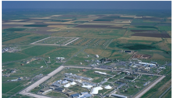
The Pantex Plant (Defense Nuclear Safety Board).