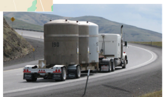
These trucks will carry the waste past our homes.

“If you are in one of the communities along the route, you have something to worry about.” High-level Energy Department official, who spoke on condition of anonymity. https://www.latimes.com/nation/la-na-nuclear-couriers-20170310-story.html