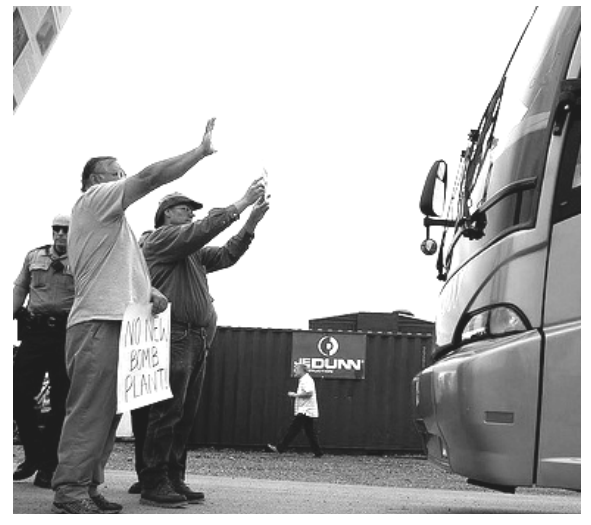
Protesters stopping dignitary bus at KCP groundbreaking.

We also chose to become involved because the new Kansas City Plant is the first major new nuclear weapons production plant that the U.S. has built in 35 years. NukeWatch first traveled to Kansas City five years ago to successfully instigate local activism.