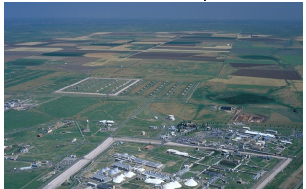
The Pantex Plant (Defense Nuclear Facilities Safety Board)