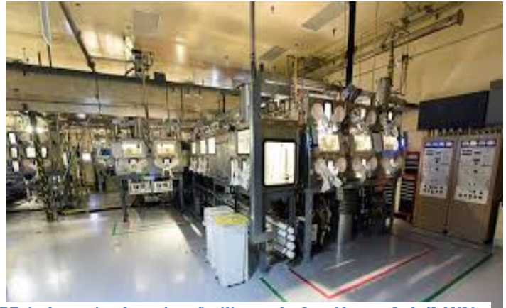
PF-4, the main plutonium facility at the Los Alamos Lab (LANL)

• It won't be easy for the Los Alamos Lab to expand plutonium pit production, given regional citizen opposition, legal requirements and problems of its own making, arguably due to its own incompetence. For example, in 2013 the Lab's main plutonium facility was shut down for over three years because of chronic nuclear criticality safety concerns. Significant safety lapses in the plutonium operations at the Savannah River Site also have been documented in recent internal government reports. An April 2019 independent study by the Institute for Defense Analysis, commissioned by the Defense Department, concluded that NNSA's plans for expanded plutonium pit production are potentially achievable but “will be extremely challenging,” are not possible by 2030, and are at “very high risk.”