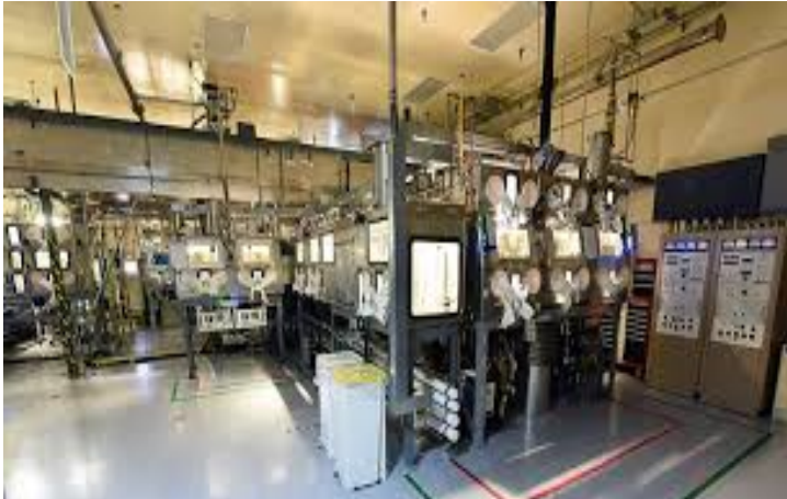
The plutonium facility at LANL.

• Plutonium pit production will be a completely new mission at the Savannah River Site, raising new budget, safety, waste and environmental problems. Moreover, the Department of Energy is <u>legally required</u> to remove plutonium from South Carolina, not add plutonium because of pit production.